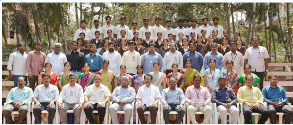
Passout Batch 2017 B Section