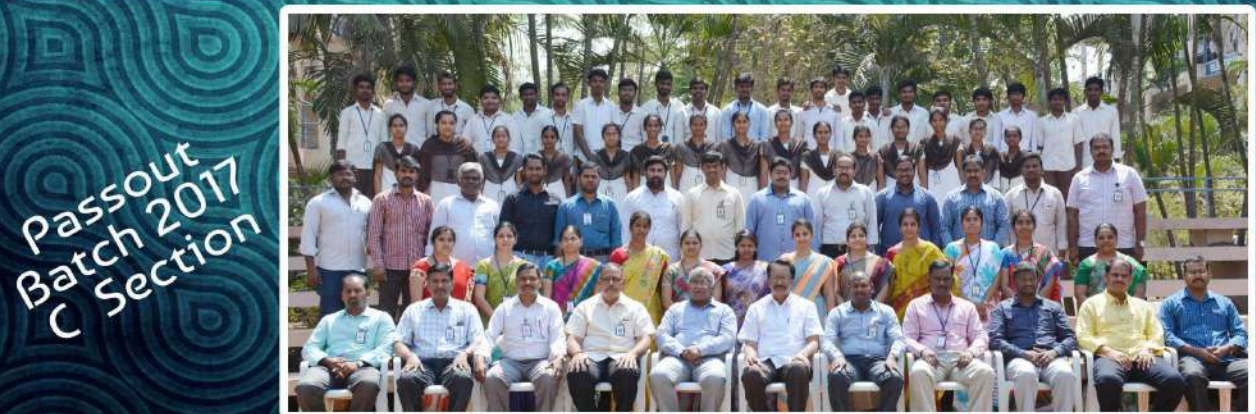
Passout Batch 2017 C Section