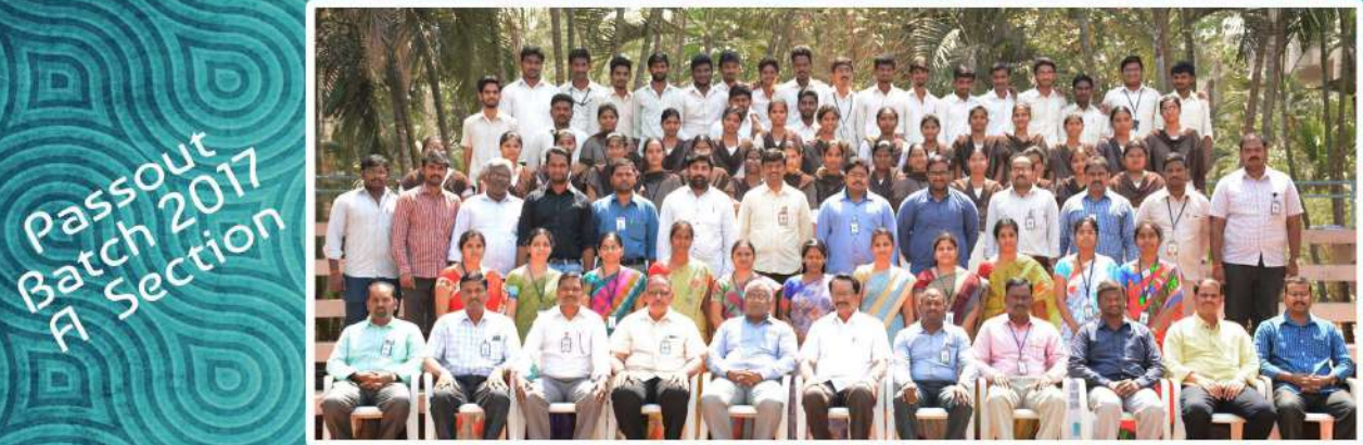
Passout Batch 2017 A Section